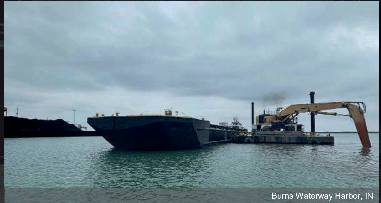
Burns Waterway Harbor, IN