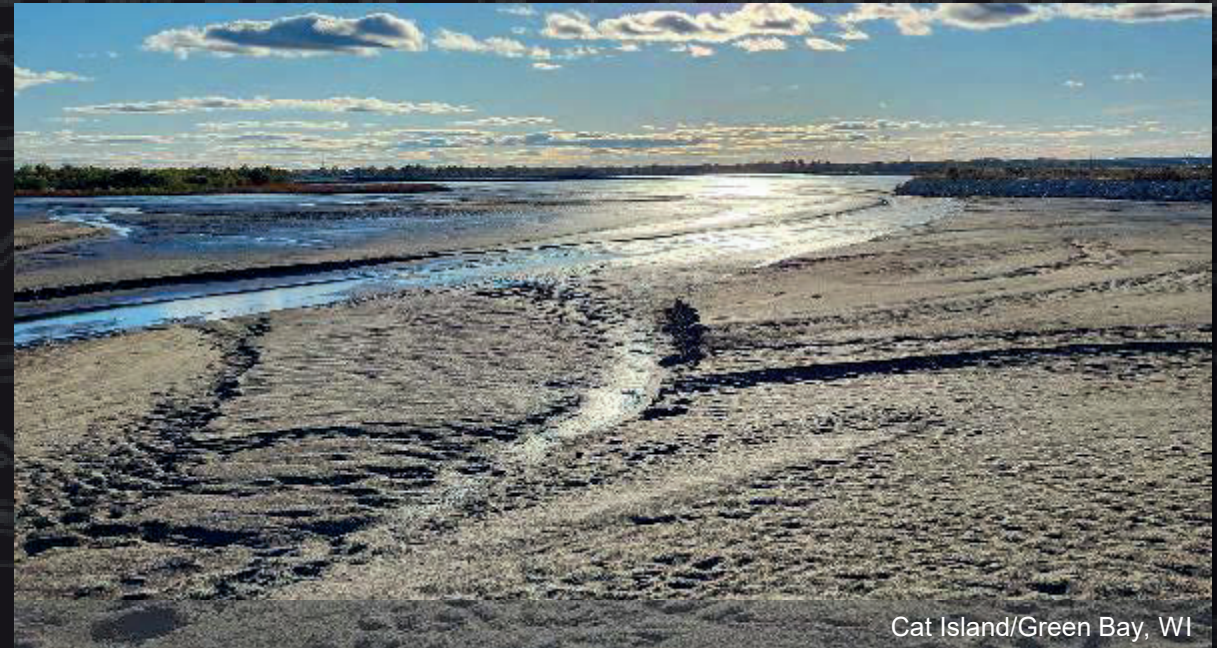
Cat Island/Green Bay, WI